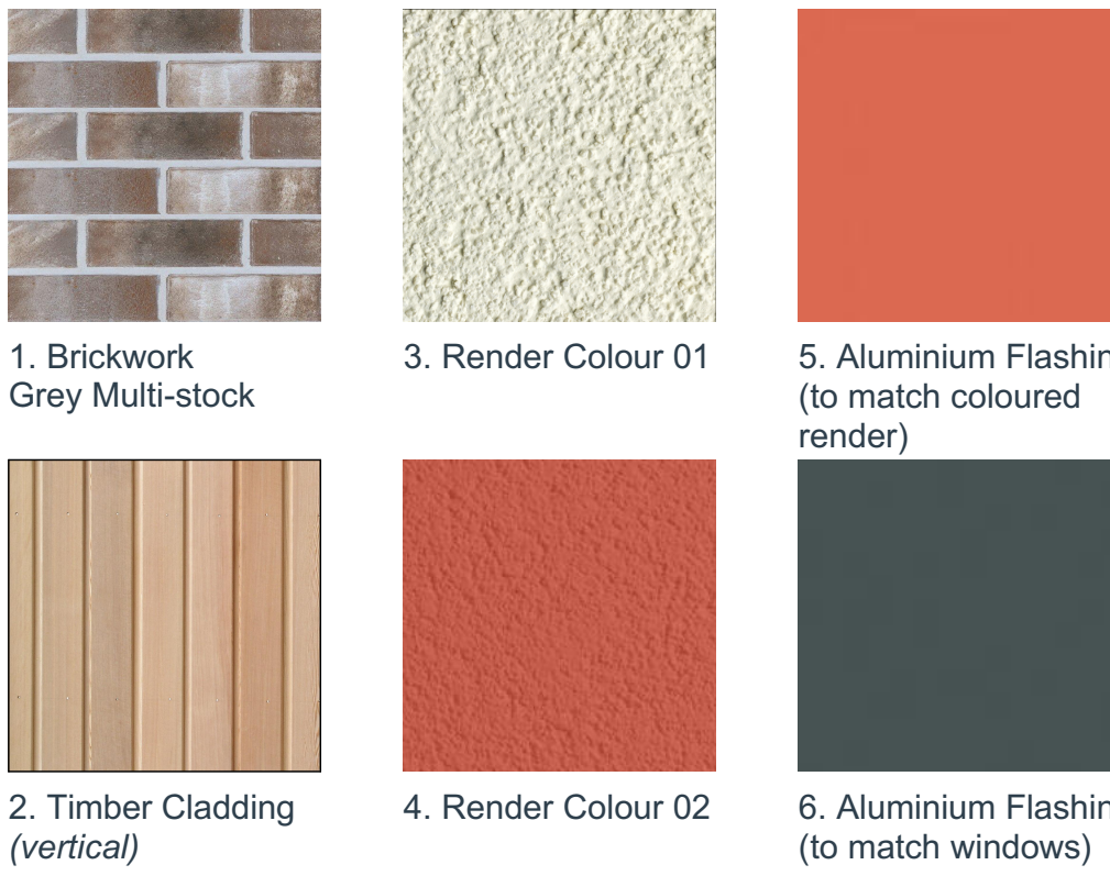
Indicative Materials Palette Render Colours to be agreed with ECC Planning Authority, dependent upon appointed academics branding.