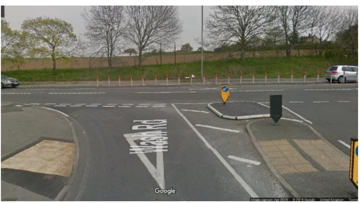
Post-Installation facing west on Wash Road (West) at its junction with A176 Noak Hill Road.