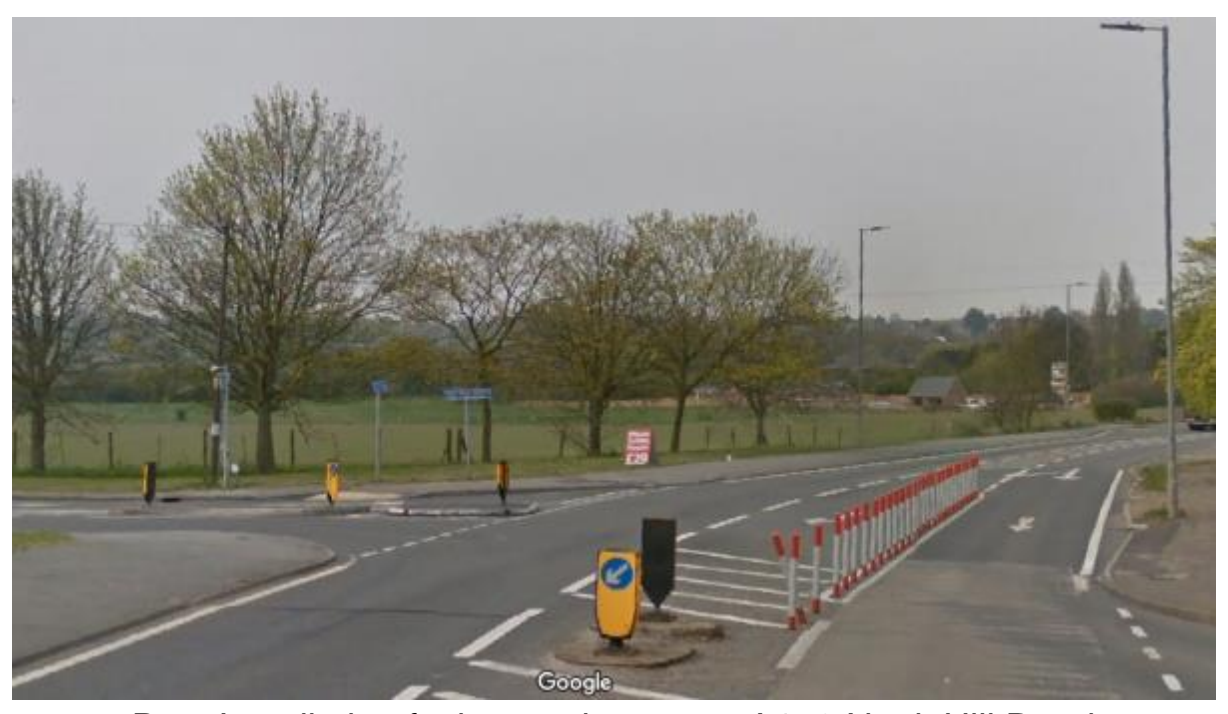
Post-Installation facing north-east on A176 Noak Hill Road