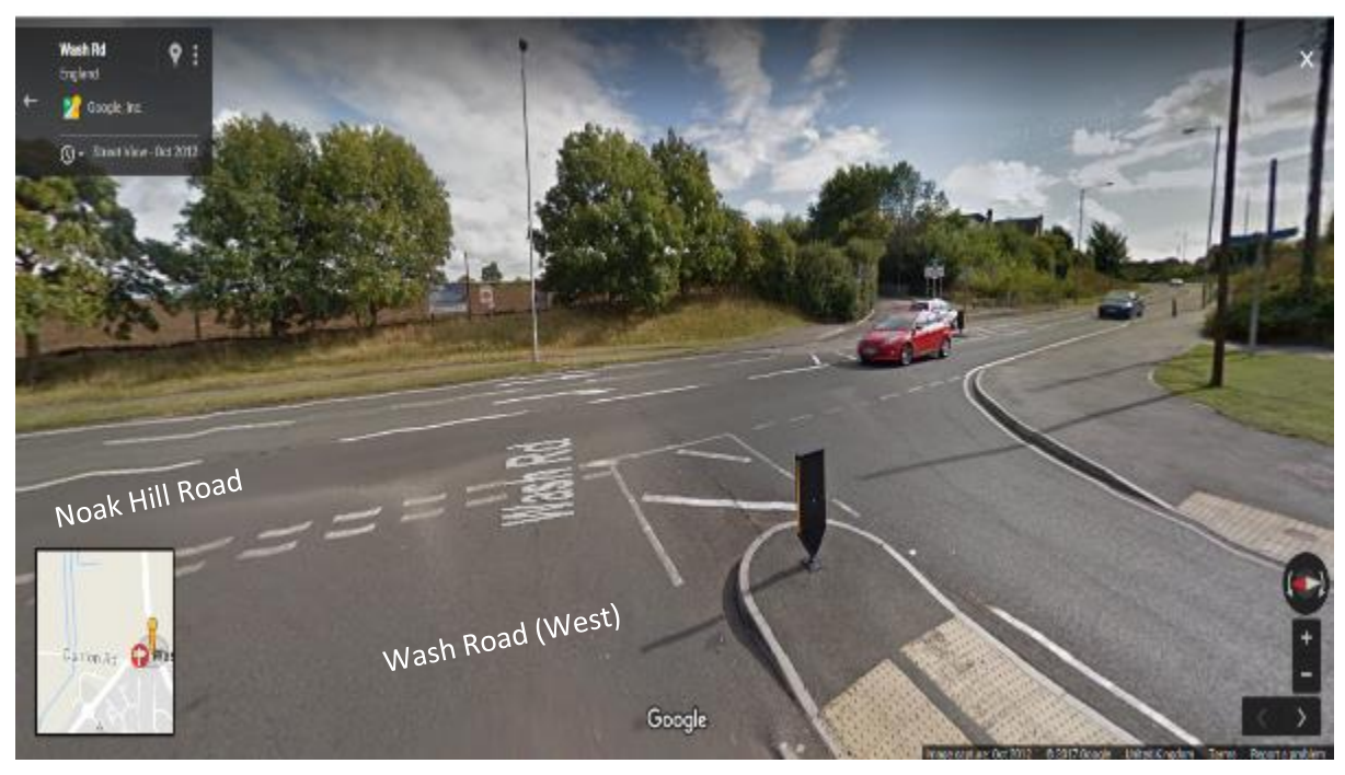
Pre-Installation facing west on Wash Road (West) at its junction with A176 Noak Hill Road.