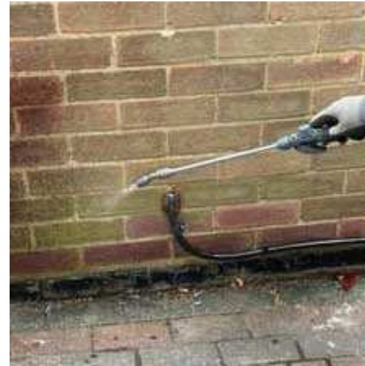
Repointing and wall sealant