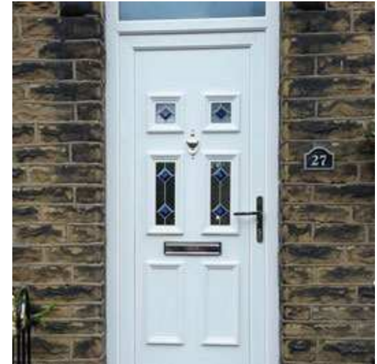
uPVC flood doors