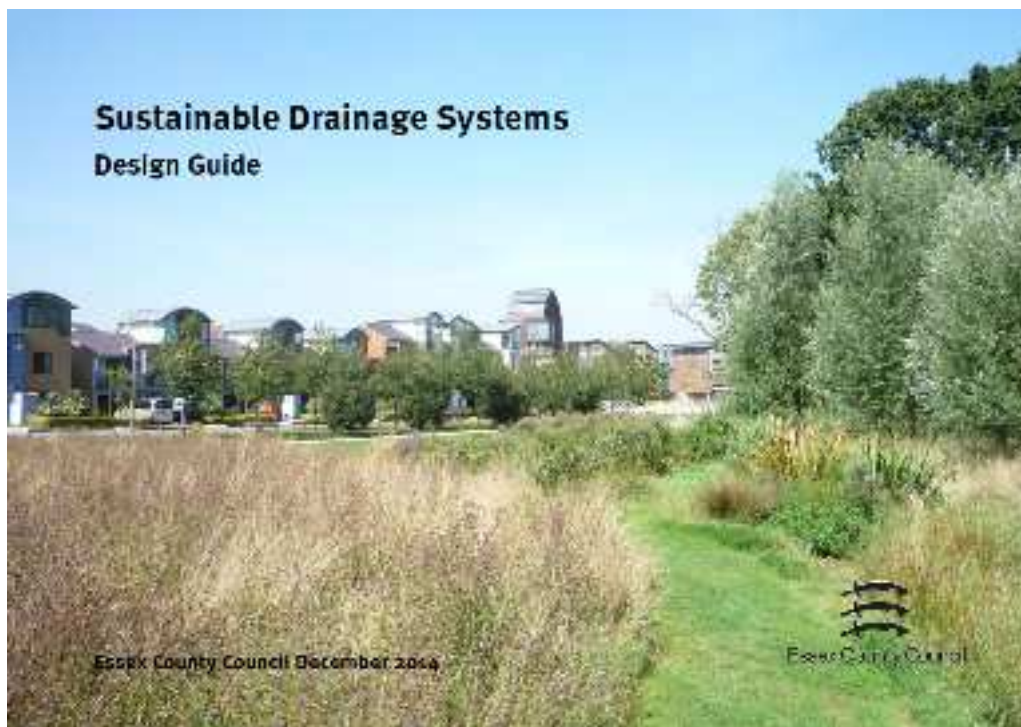
Figure 2: SuDS Design Guide