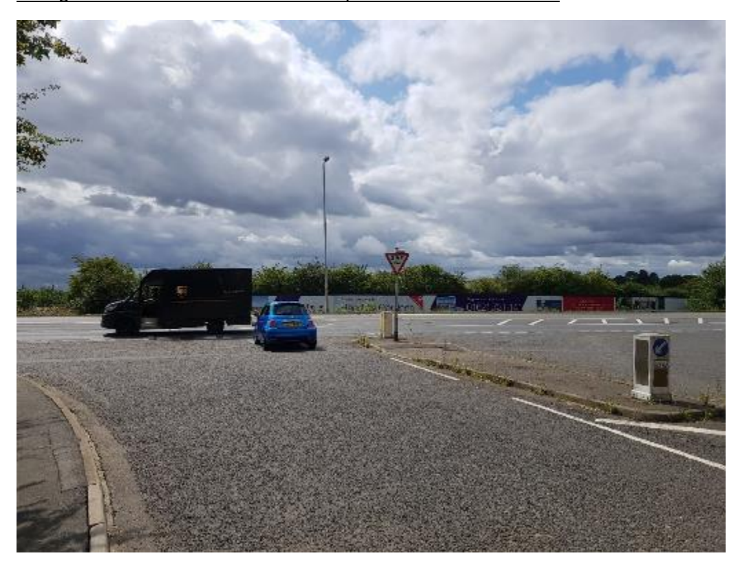
Facing North West on B1018 Limebrook Way towards the Maldon Road Roundabout:

Facing south onto B1018 Limebrook Way from Meeson Meadows: