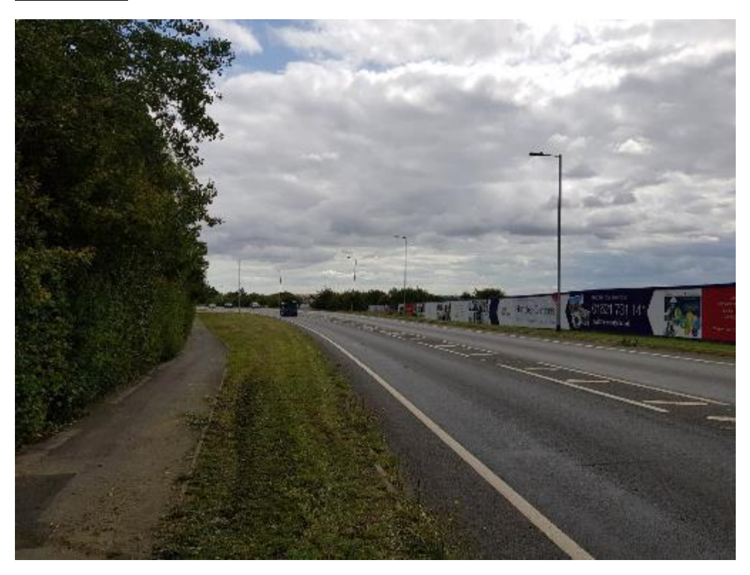
Facing east at B1018 Limebrook Way at the junction with Meeson Meadows:

<u>Facing south east on B1018 Limebrook Way (From the western end near the Maldon Road roundabout):</u>