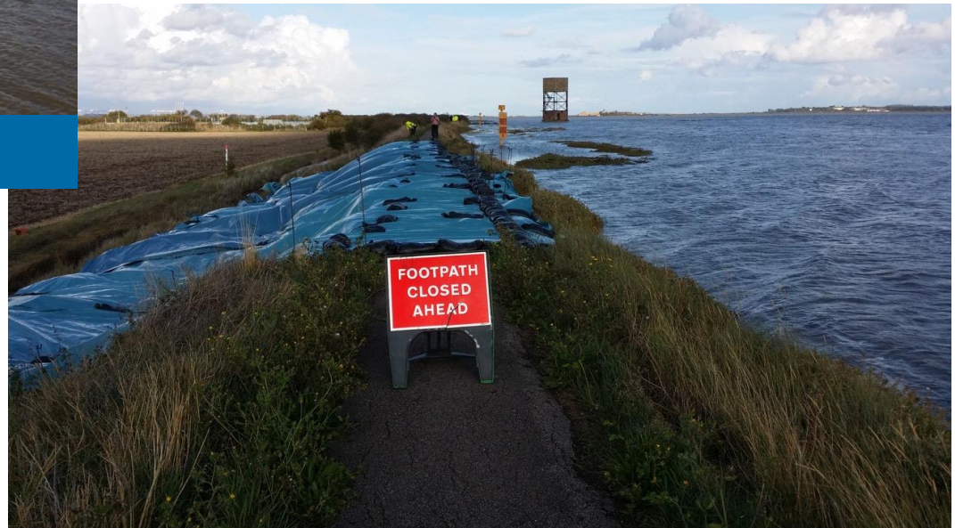
View of damage mitigation following overtopping on Monday 30 September 2019