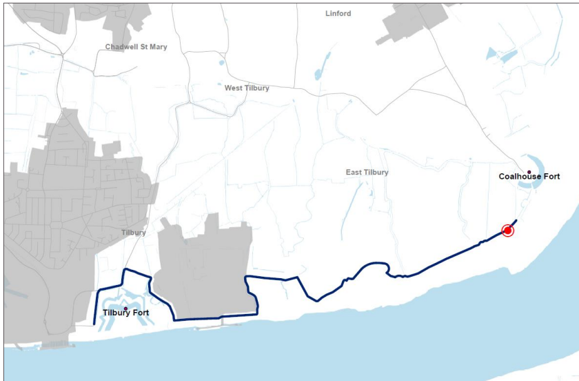
Map showing PRoW Footpath 146