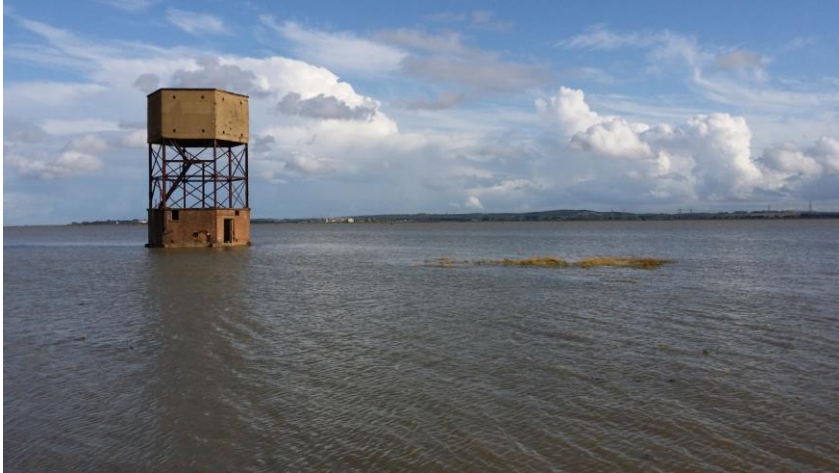
View of raised Thames water levels on Tuesday 01 October 2019