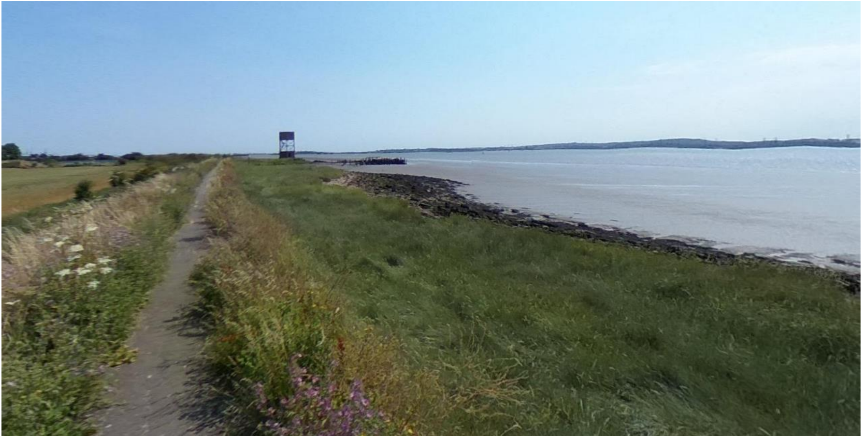
View eastbound towards East Tilbury Radar Station, showing typical water levels of the Thames and Flood Defence