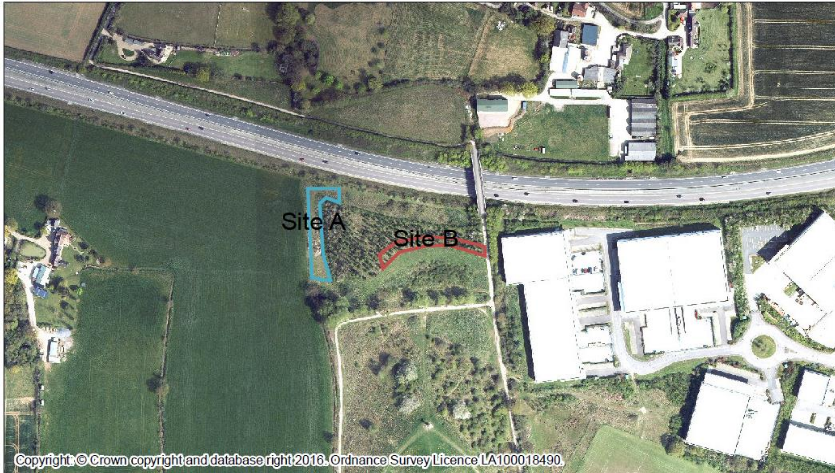
Title: Potential Allotment Sites at Discovery Centre