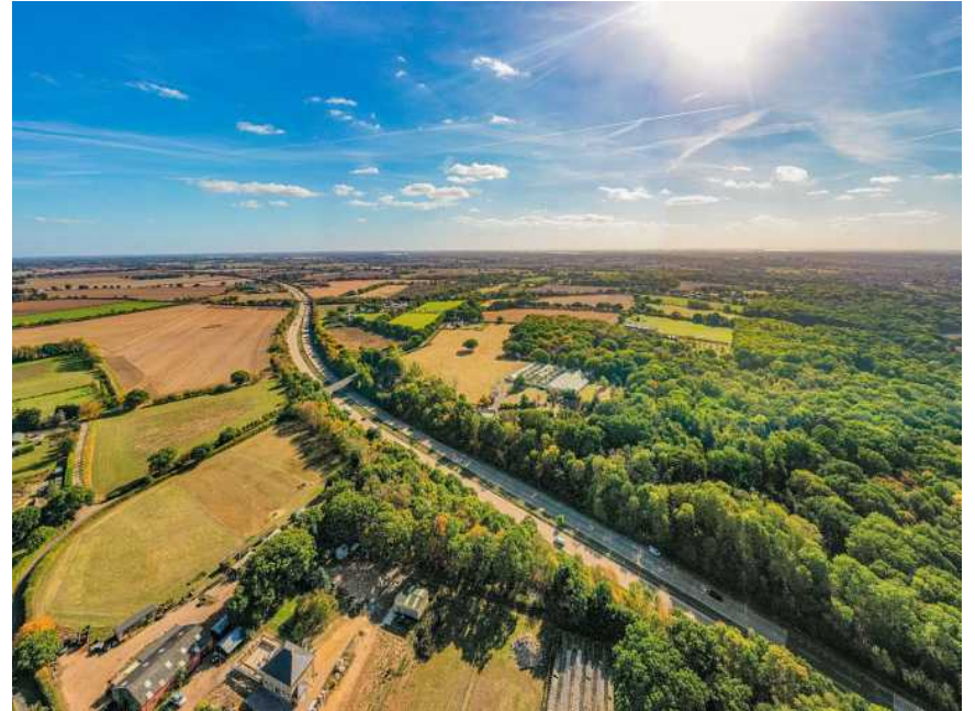
Above: Drone photography of TCBGC site area, with A120 heading east in the centre of the image.

Latimer fully supports the Infrastructure First ambitions of the project in this respect.