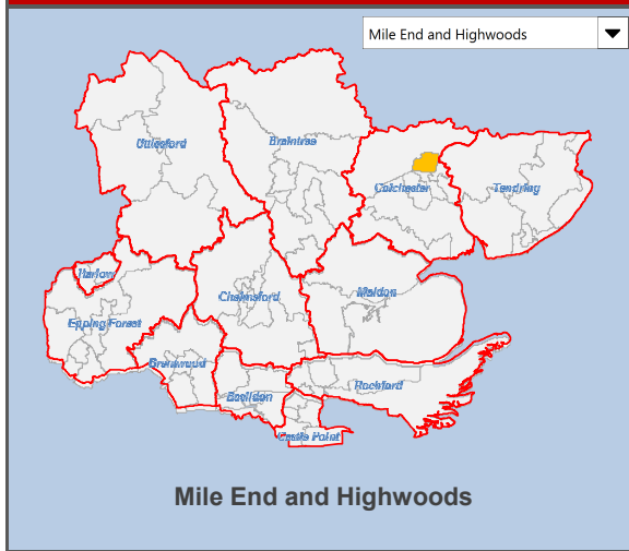
Mile End and Highwoods