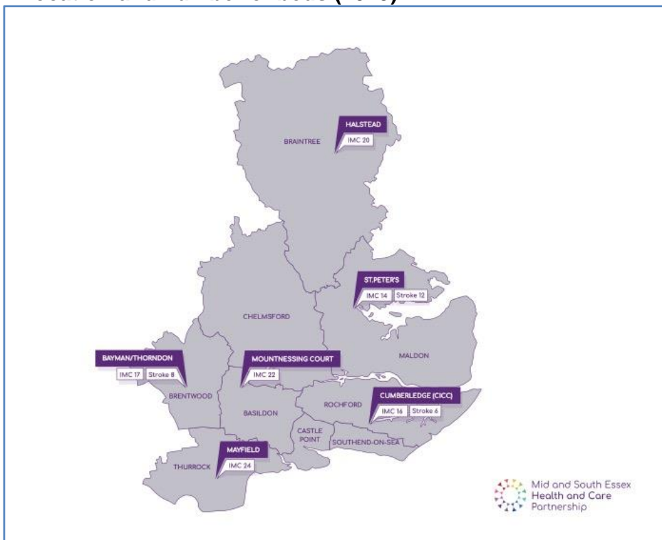
Exhibit 1: Location and number of beds (2019)

The exhibit below shows the location and number of community beds in 2019, prior to any of the changes introduced in response to COVID . At that point, there were two main types of beds – intermediate care (IMC), which generally provided care for people who were well enough to be discharged from a main hospital but were not yet able to return home, and stroke care beds, which provided rehabilitation for people who had suffered a stroke.