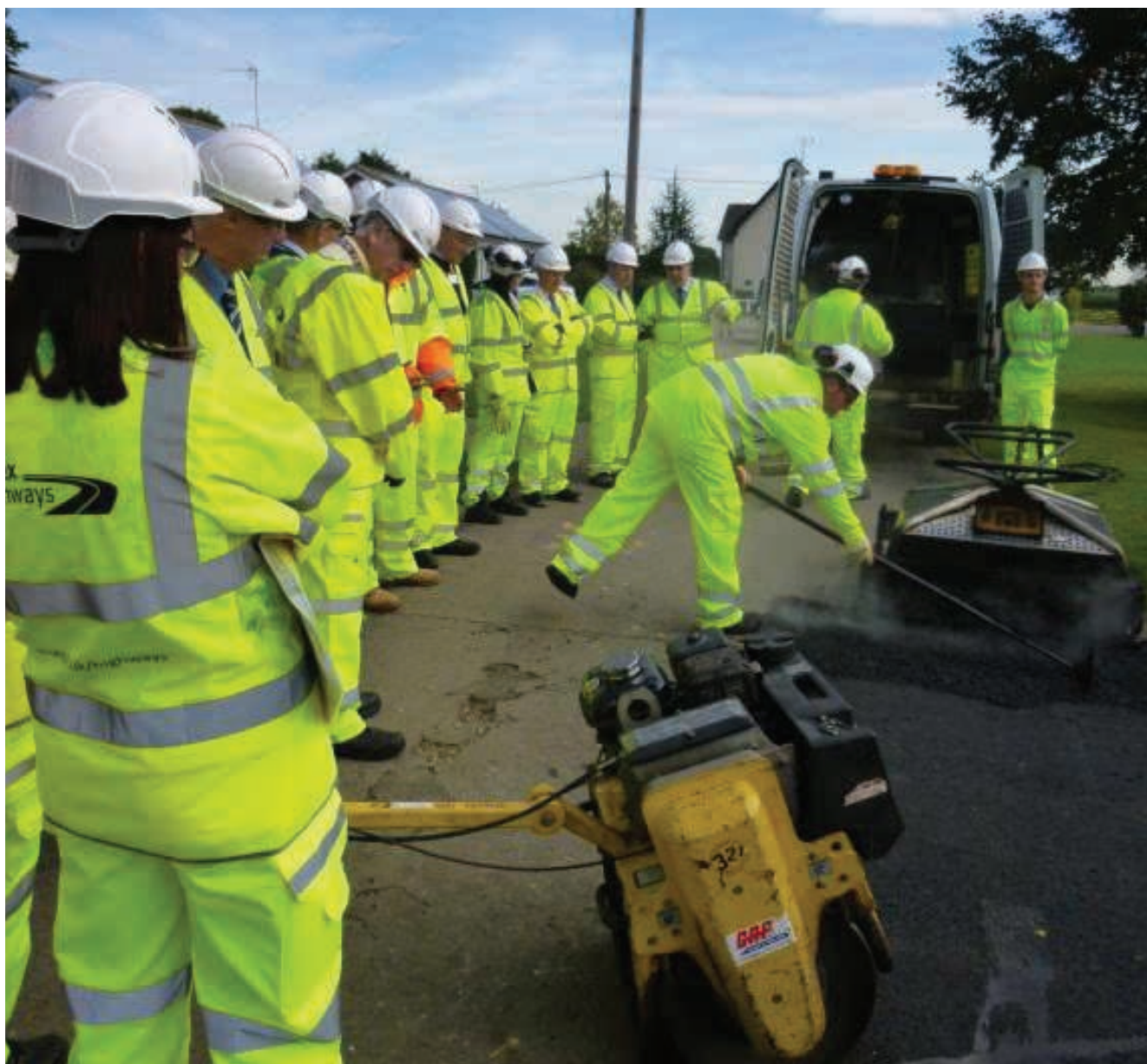
The Place Services and Economic Growth Scrutiny Committee spent a day on site learning about various methods of road surface repair (see case study)

For more detail about how scrutiny works in Essex County Council you can consult the Council's constitution which specifies the committees' responsibilities, remit and procedures. Or you can visit ECC's scrutiny website or contact the Scrutiny team . For those using a paper version of this report, contact details are on the back page of this report.