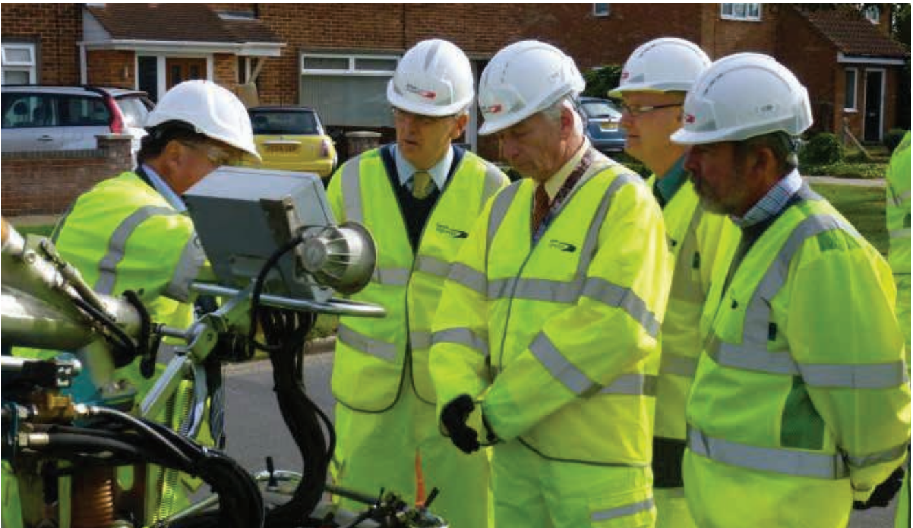
The Place Services and Economic Growth Scrutiny Committee spent a day on site learning about various methods of road surface repair (see case study)

Councillors concluded that this level of insight will be crucial in their role as a scrutiny committee considering these issues, accepting that the incidence of potholes would continue to be at the forefront of public concern but proposing that this type of insight would help the Committee consider how best to represent their interests. A report of the visit and findings was presented in November 2014.