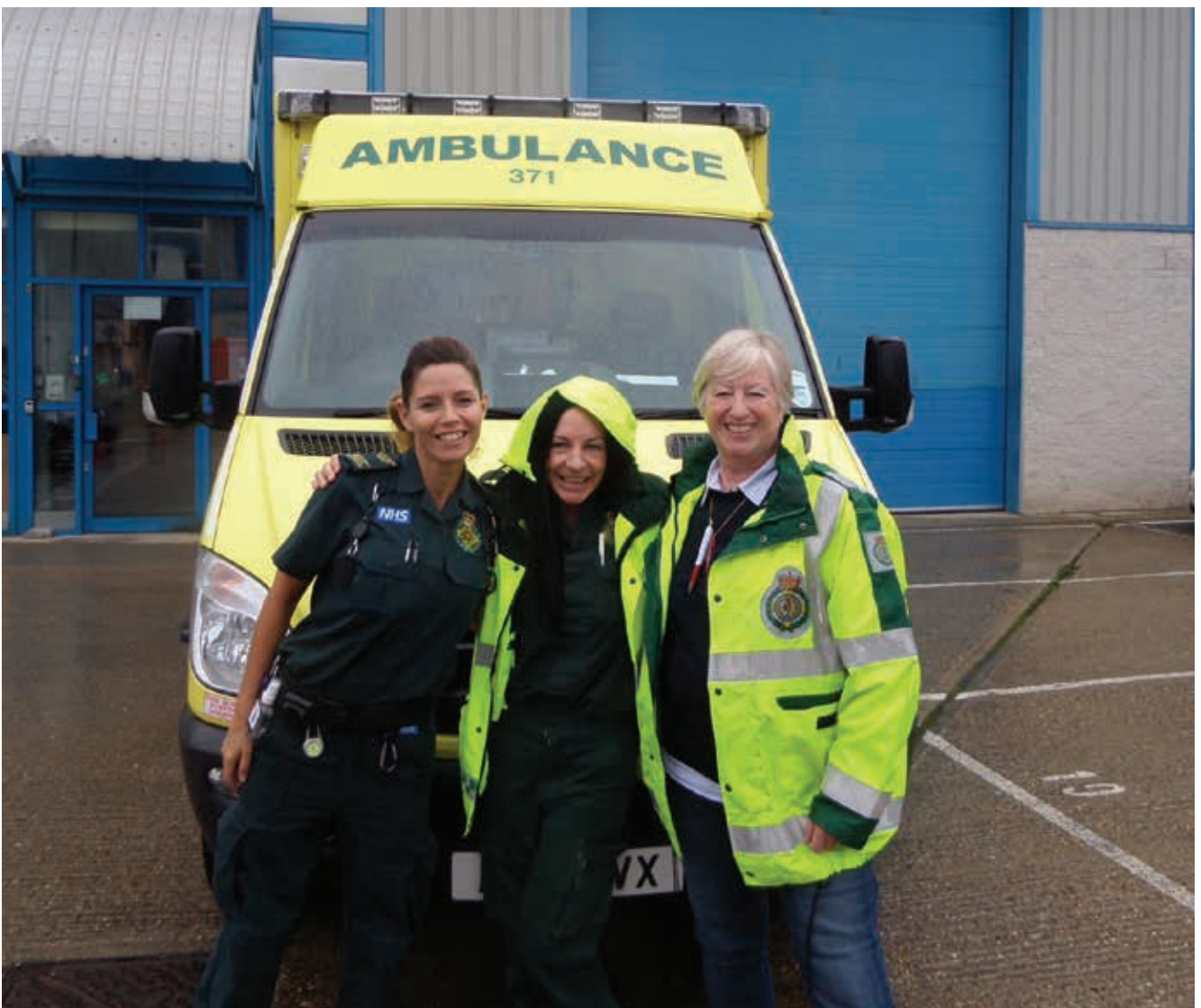
Some members of the Health Overview and Scrutiny Committee rode out for a day with ambulance crews, to see at first hand the day-to-day pressures on the service.

In its conclusions in July 2015 , the Group acknowledged good practice in a number of areas but that there is still significant opportunity to improve patient communications and engagement, and the sharing of knowledge and learning in the Trusts. Consequently the Group made recommendations about better Patient Engagement, making it easier to complain and give feedback, learning from complaints, staff training and improving the way the HOSC receives and uses information.