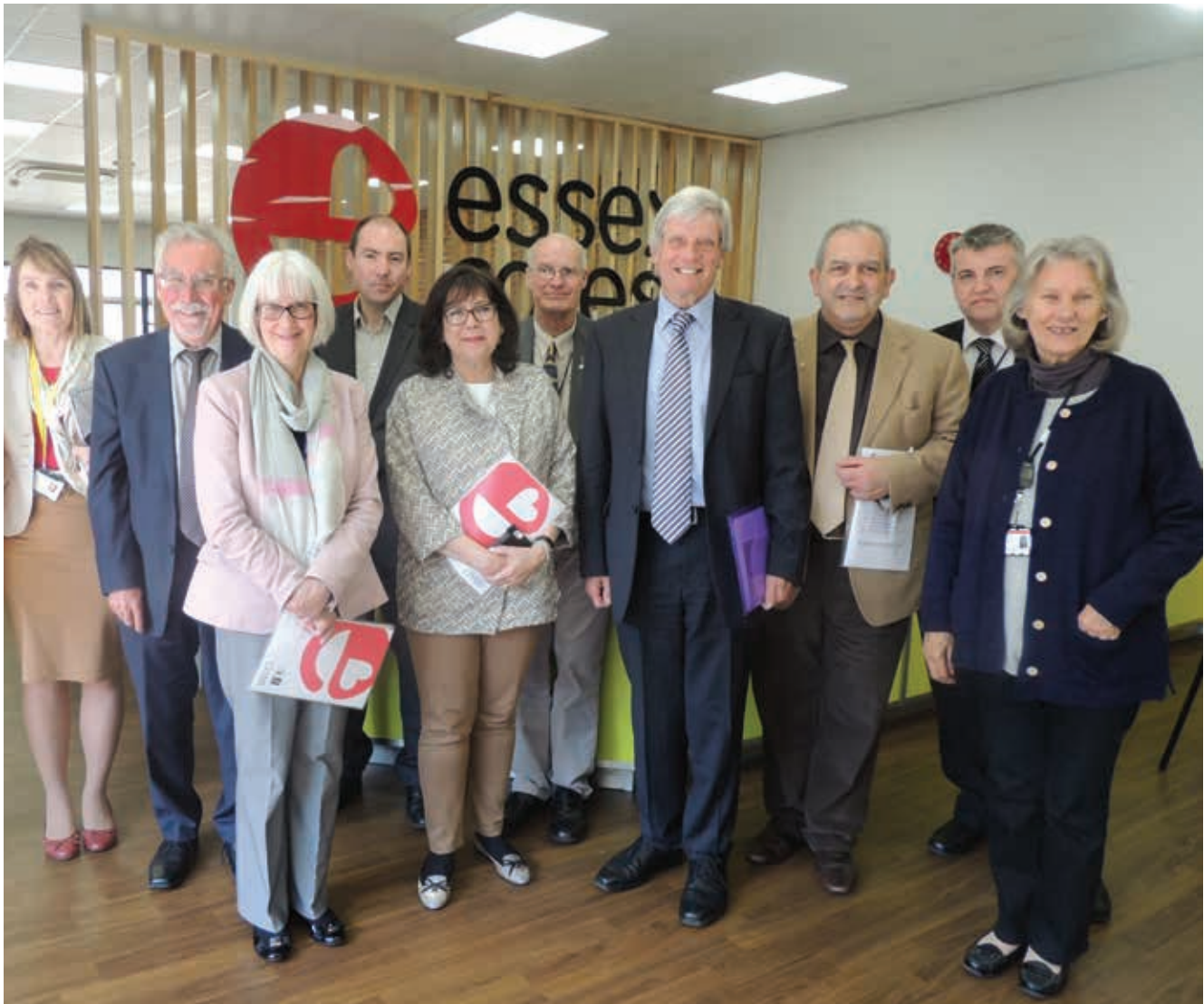
Members of the People and Families Scrutiny Committee visit Essex Cares’ Harlow Hub

One outcome of the discussion was a recommendation that Essex Cares’ Annual Accounts be added to their website to support openness and transparency - this was done.