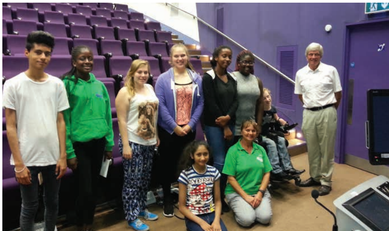
Members of the Young Essex Assembly held a workshop to give their response to the People and Families Scrutiny Committee's Educational Attainment report