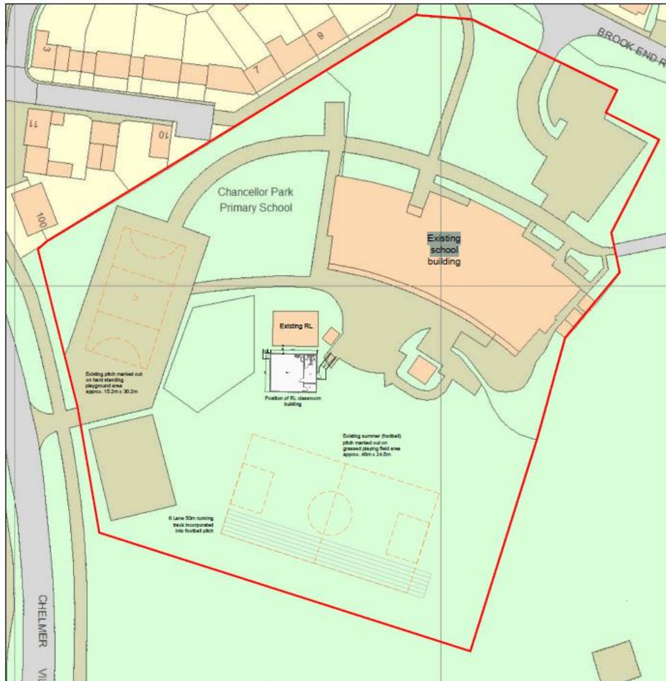
RL Classroom @ 1:500